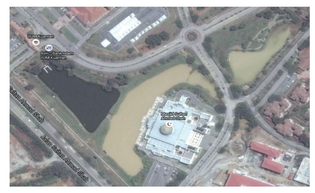
Fig. 1. Overview of IIUM Kuantan Lake.

Polymerase chain reaction (PCR) amplification of the 16S rRNA gene was performed using the following set of primers: 27F 5'-AGAGTTTGATCCTGGCTCTCAG-3' and 1492R 5'-GGTTACCTTGTTACGACTT-3'. The PCR reactions were performed in a final volume of 50 µl which consist of 200 ng DNA template, 25 µl of MyTaq™ Mix 2X (Bioline, UK) and 0.4 µM primers under the following conditions: initial denaturation at 94°C for 5 min, followed by 30 cycles of 94°C for 30 s, 55°C for 60 s and 72°C for 4 min; and extension step at 72°C for 10 min. The amplification products were confirmed using 1% agarose gel and sent to 1st Base Laboratory, Malaysia for purification and sequencing. The resultant 16S rRNA gene sequences were manually verified and edited using BioEdit sequence alignment editor. The partial nucleotide sequences analysis of the isolates was carried out via the GenBank BLASTn search tool.