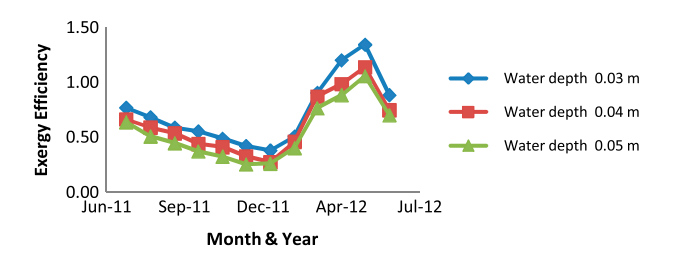
Fig. 4. Daily exergy efficiency.