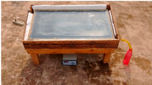
Fig. 1. Pictorial view of the experimental setup.

Experiments were conducted at Chennai ( 13^\circ 5' 2'' N, 80^\circ 16' 12'' E), Tamil Nadu, India, from April 2015 to June 2015 during 9 am–5 pm (daylight hours). The experiments were conducted with different types of water samples. The water level was maintained at 1 cm for all the experiments. The saline water was